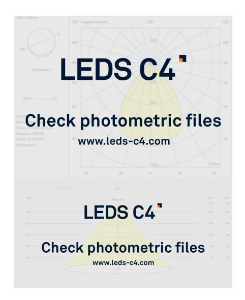
Image may not match reference. LedsC4 reserves the right to amend any of the product's components. The data related to flux, power and colour temperature may be subject to changes made by the manufacturer.