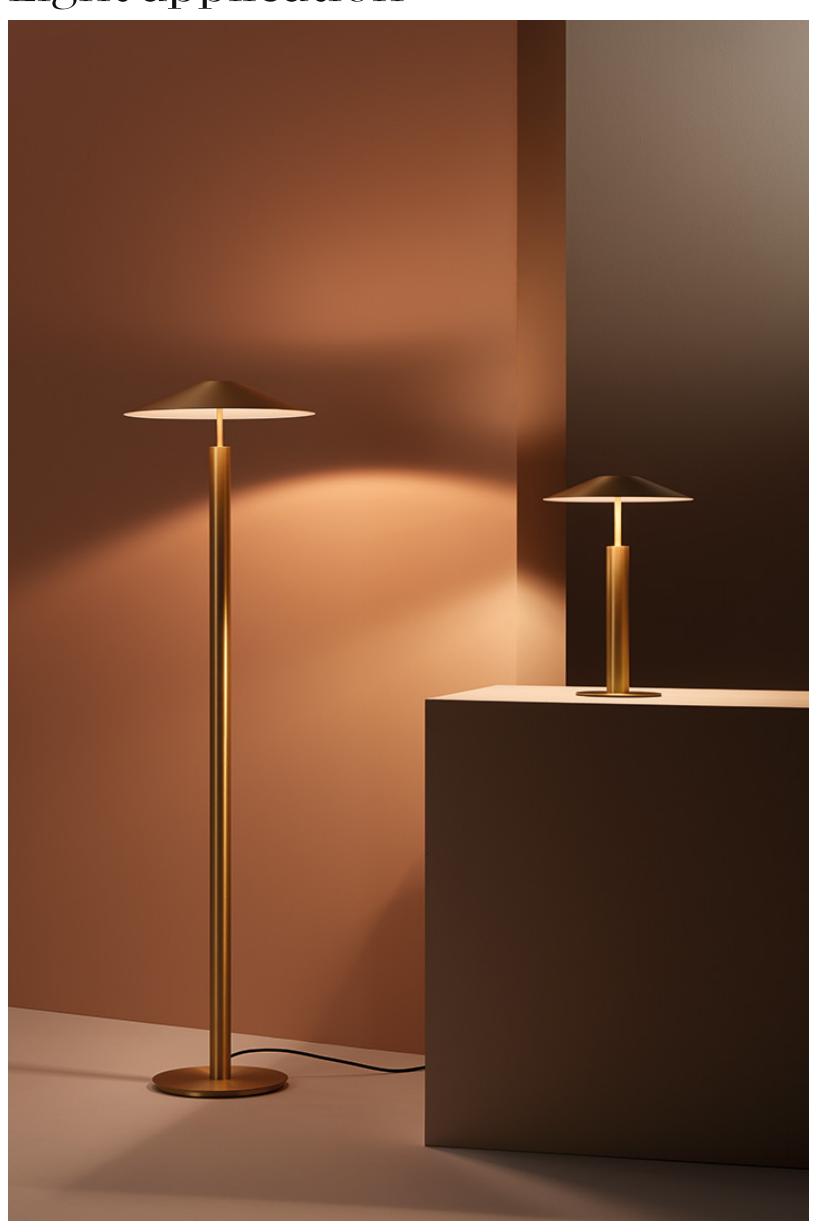
Image may not match reference. LedsC4 reserves the right to amend any of the product's components. The data related to flux, power and colour temperature may be subject to changes made by the manufacturer.