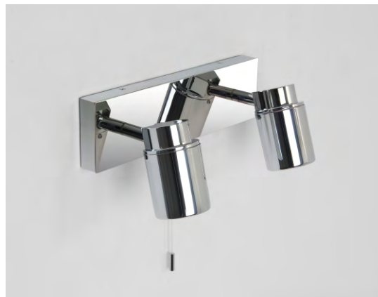
CODE: 1282005 (8484) FINISH: POLISHED CHROME

TO MAINTAIN THIS PRODUCT TO ITS BEST CONDITION, PLEASE VIEW OUR CARE AND CLEANING GUIDE ON THE SUPPORT SECTION OF THE ASTRO WEBSITE.